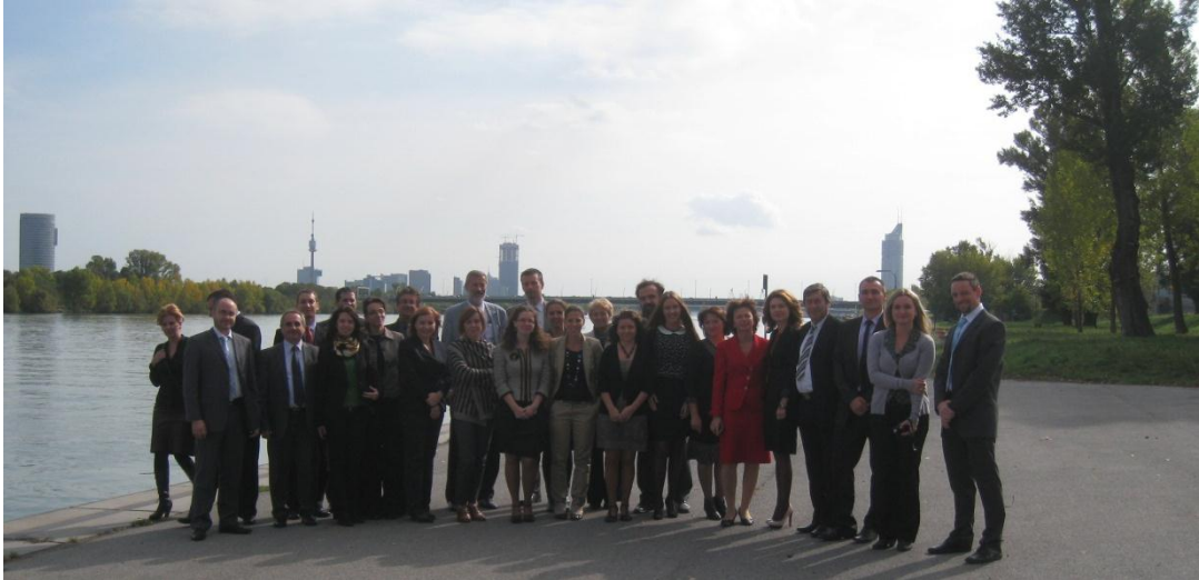
The CO-WANDA Consortium at the Kick-off Meeting in Vienna

Two years of pioneer work in the field of ship borne waste management are lying ahead, starting with defining the conceptual approach. The first meeting of the International Implementation Board is scheduled for spring 2013, setting the first milestone for the preparation of the IDSWC, followed by the implementation of pilot tests in summer 2013.